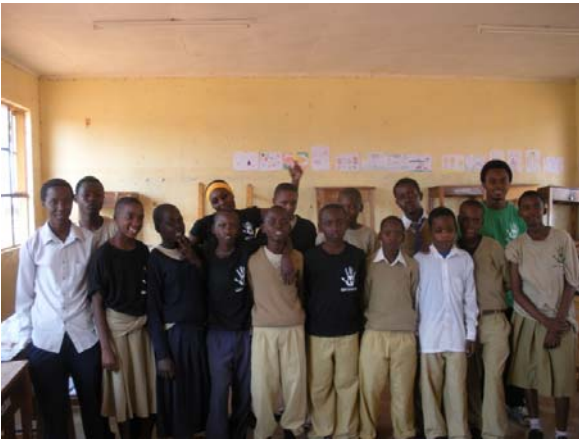
My class of secondary school students at Namanga secondary school