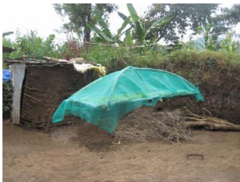
A food dryer