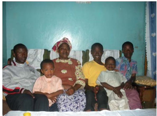
My home-stay family