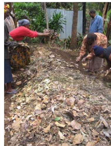
Making a double-dug bed as part of the bio-intensive agriculture practicals