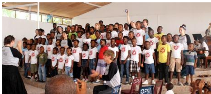
Ste. Trinite School of Music, Port-au-Prince