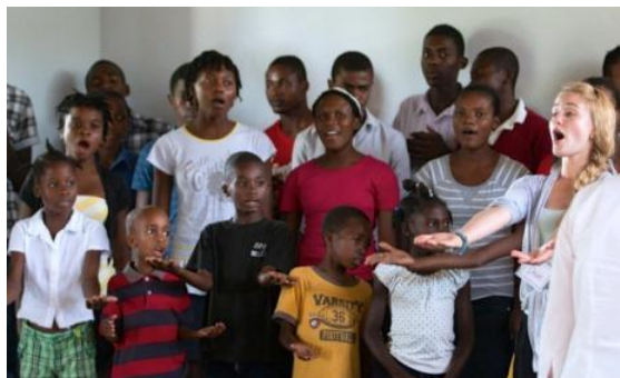
Central Plateau, Haiti