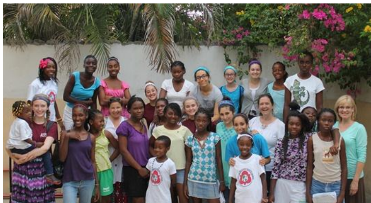
Earthquake Home, Port-au-Prince