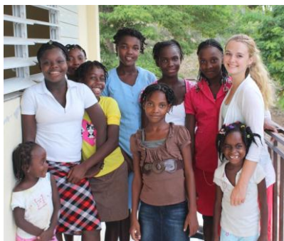
The Island of LaGonave, Haiti

Thank you, St. Peter's, for supporting the work of SOUND For Haiti as the team has opportunities to bless and be blessed through music and in coming alongside brothers and sisters in Haiti through presence and prayer.